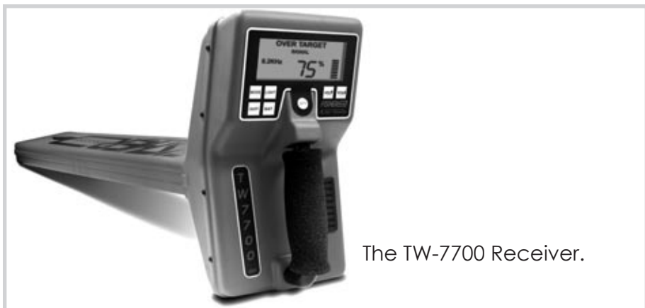
The TW-7700 Receiver.