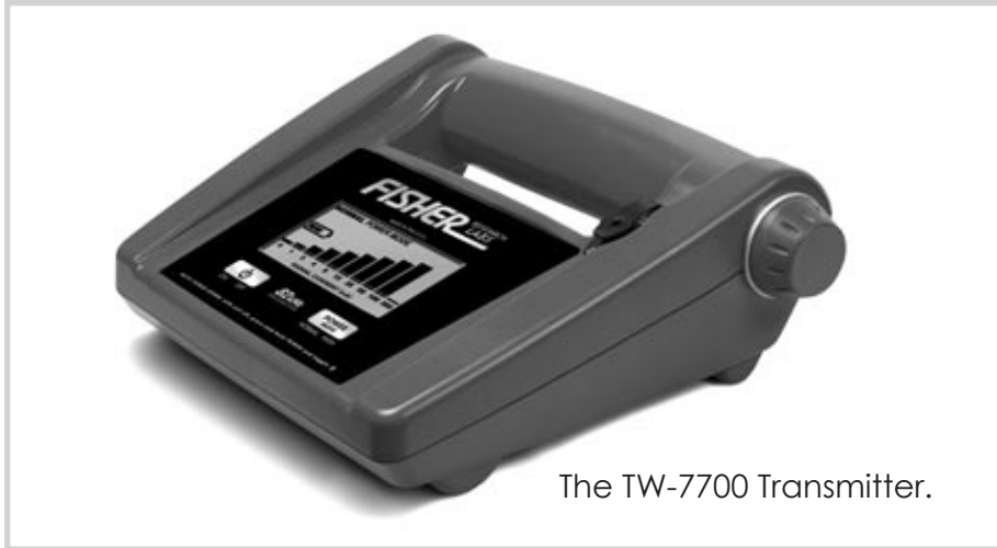
The TW-7700 Transmitter.

The Transmitter has two controls: On/Off & Power/Mode . The Power/Mode Button has a dual function