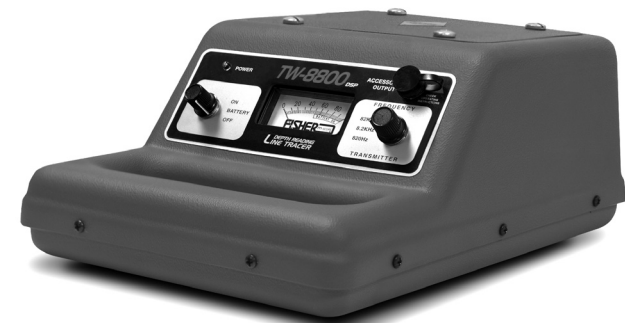
The TW-8800 Transmitter.

WARNING: Do not connect output leads to a live (energized) utility. Please prevent shock hazard and equipment damage.