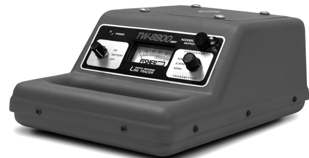
The TW-8800 Transmitter.

WARNING: Do not connect output leads to a live (energized) utility. Please prevent shock hazard and equipment damage.